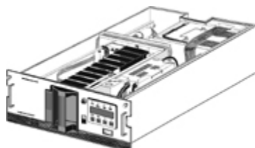
Compaq StorageWorks TL881 Library

Installation services may also be ordered for customers who wish to have a certified Compaq Engineer perform an on-site library installation.